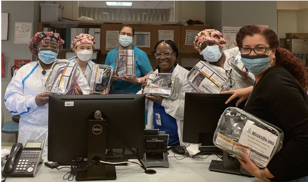
Clinicians in an oncology unit receiving their Mask Kits